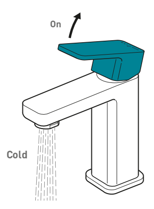
Moving the mixer lever upwards will increase the flow of cold water.