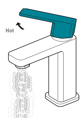
Moving the mixer lever to the left will increase the water temperature.