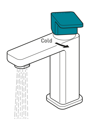
Moving the mixer lever to the right the water will stay cold.