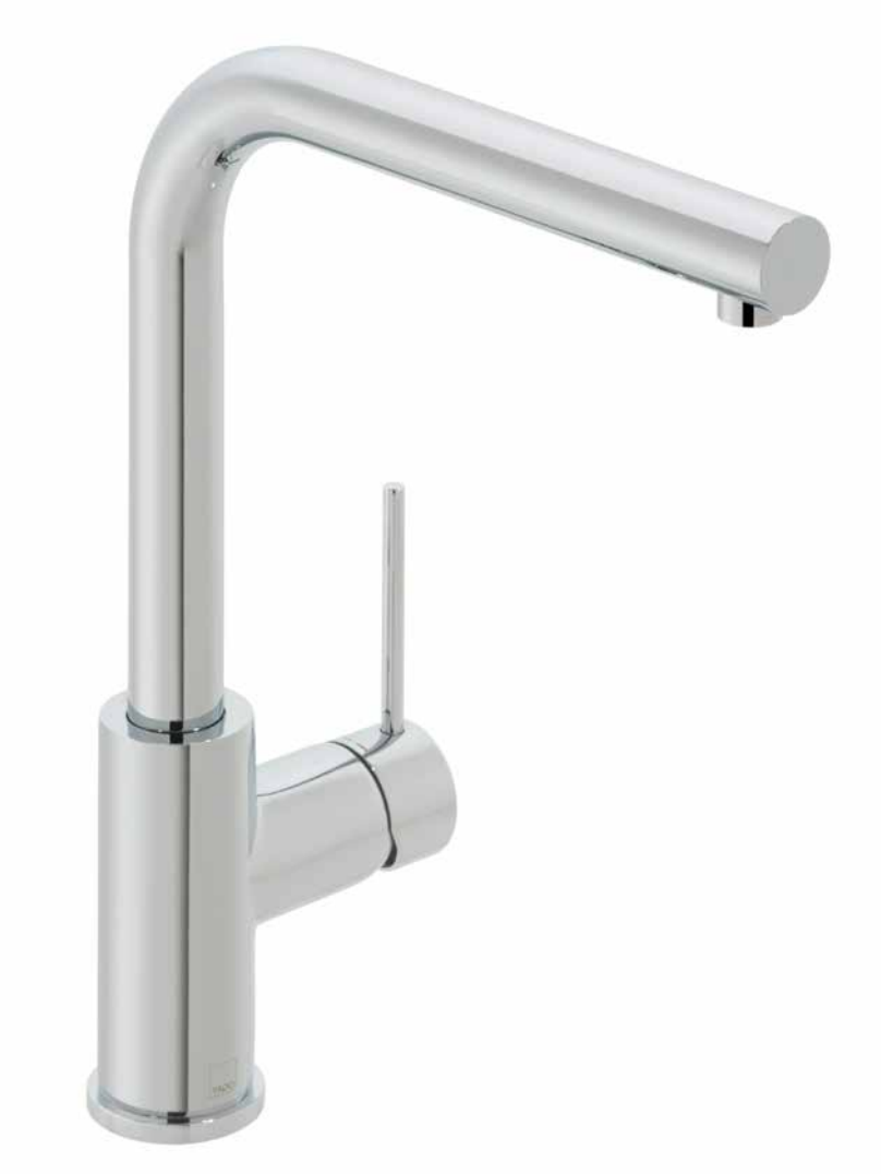
1.0 bar MP CUC-1007-C/P